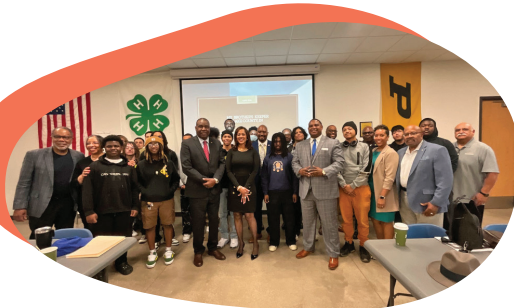
MBK ROUNDTABLE MEMBERS