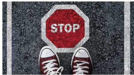
STOP OPIOID AWARENESS CAMPAIGN