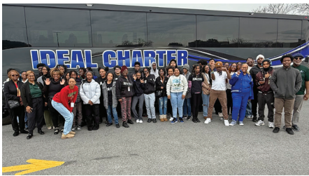
COLLEGE & CAREER EXPO